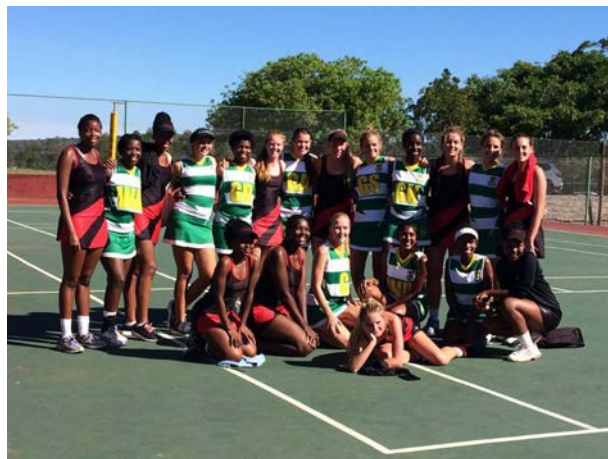
(Top) 1st XV Rugby against Bishops. (Bottom L-R) 1st XI Hockey Girls pictured at the Spar EC North 1st Team Challenge; 1st Team Netball girls made it to the finals in the U19 Woodridge Netball Festival

This first term has gone in a blur and the Easter holiday is upon us. I have no doubt that the holidays will provide a very welcome break for your children from the routine of school. Similarly, can I take this opportunity of thanking all those players and coaches who will be giving part of their holiday to represent the school. If you are near any of the venues where Kingswood teams are playing please come out and support the school.