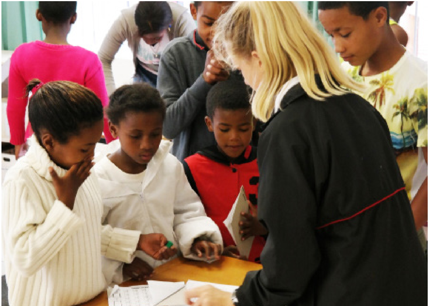
Kingswood College Pupils assisting with Lebone Centre Family Maths Event

Continuing on the theme of cathedrals, a much younger one was built, just over 10 years ago, in the form of the Lebone Centre. On Wednesday, I attended the annual AGM and Trustees' meeting of the ICDP Trust and Lebone Centre, and once again, was in awe of the tremendous work they are carrying out in our community with regard to literacy, early childhood development, reading programmes, parent workshops and so much more. We salute the staff of the Lebone Centre for the outstanding and selfless work they are conducting.