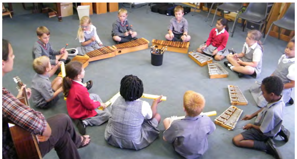
The Grade 2M class during their Class Music lesson