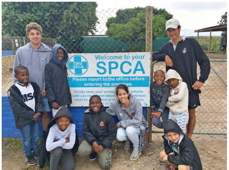
A group of VVV boys visited the SPCA to spend some time with the animals, walking and feeding them.

After quiet time in the afternoon they will be allowed to play games on their PSP's and relax with friends. We have no doubt that a few U13 boys will grab their hockey sticks to practice a few more skills in anticipation of the hockey festival starting on Wednesday.